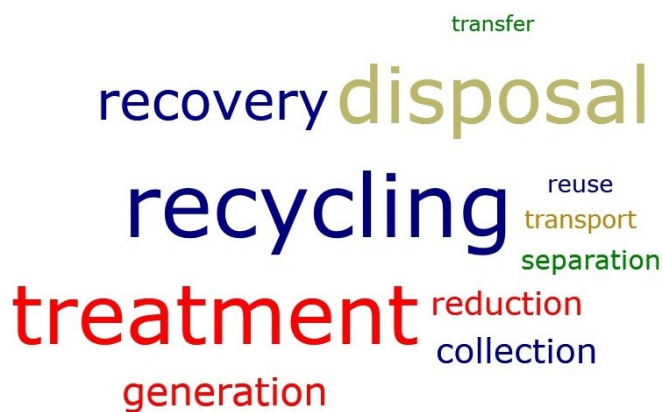
Figure 3 Elements argumentative dimension word cloud

Figure 3 relates to the argumentative dimension of elements.