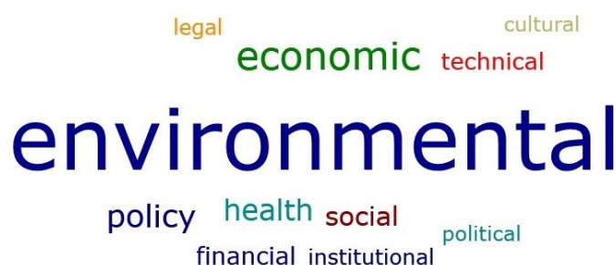
Figure 4 Aspects argumentative dimension word cloud

Figure 4 relates to the argumentative dimension of aspects. The topics most treated are related to the aspects dimension is environmental. The environment is important in integrated waste management because the impacts resulting from the waste processing process will cause ecological, social, economic, and aesthetic problems.