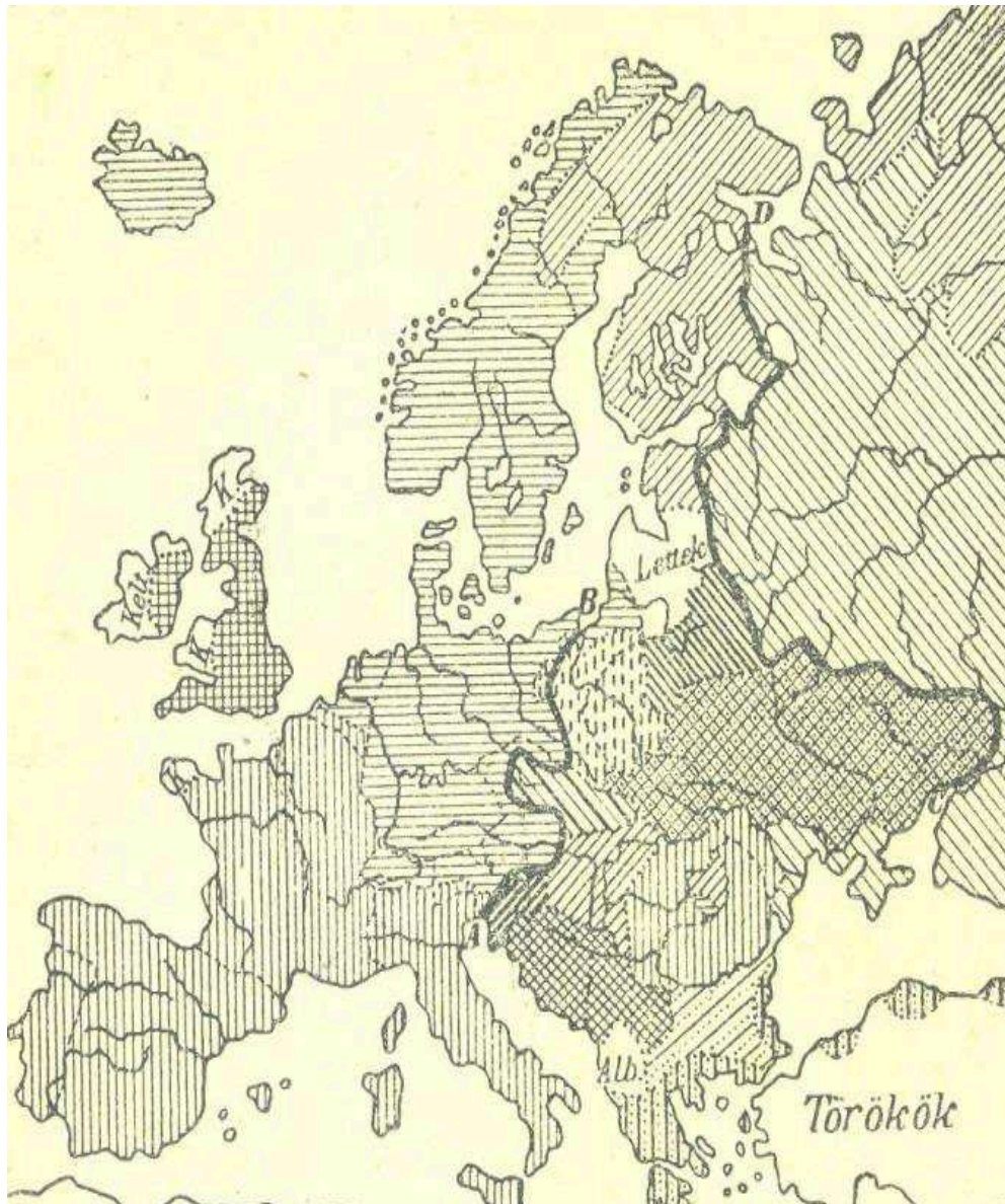
Figure 4: Europe's Critical Zone