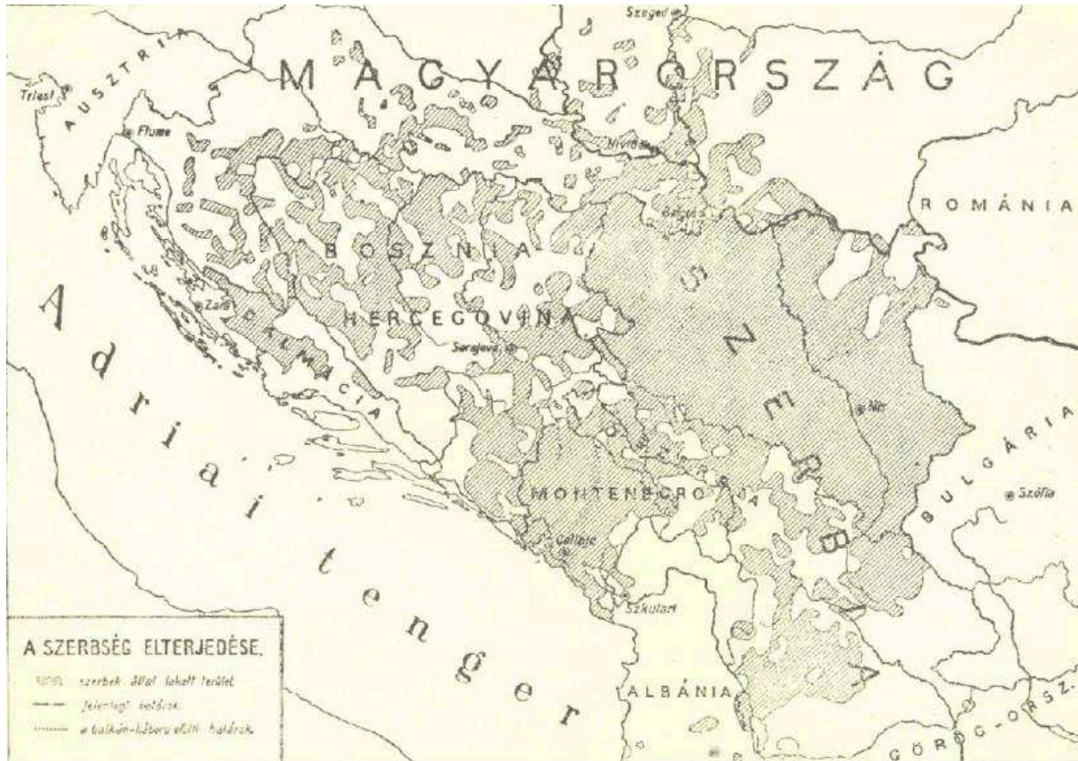
Figure 1: Spatial Distribution of the Serbs