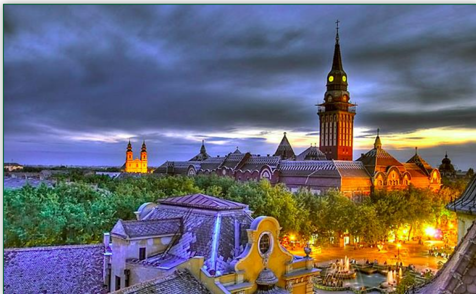
Figure 5: Subotica from aerial perspective

The most important development factor of Subotica is its geographic location, which is determined by the closeness of the EU member Hungary, the significance of the north-south transport corridor X/b and the railway line between Budapest and Belgrade that will be modernised soon.