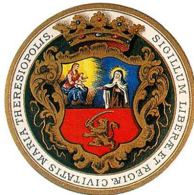
Figure 6: The coat of arms of Subotica

In 1779, Empress Maria Theresa of Austria proclaimed the settlement a Free Royal Town. At that time the inhabitants renamed Subotica as Maria-Theresiopolis. This act served as the basis for intensified economic and special development in the town, attracting many people from all over the Habsburg Monarchy, which led to a considerable demographic change with an increasing number of Hungarians and Jews settling in Subotica.