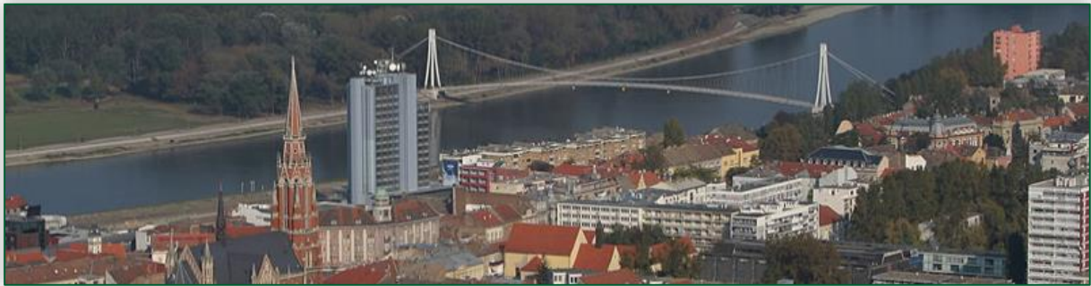
Figure 3: Osijek from aerial perspective